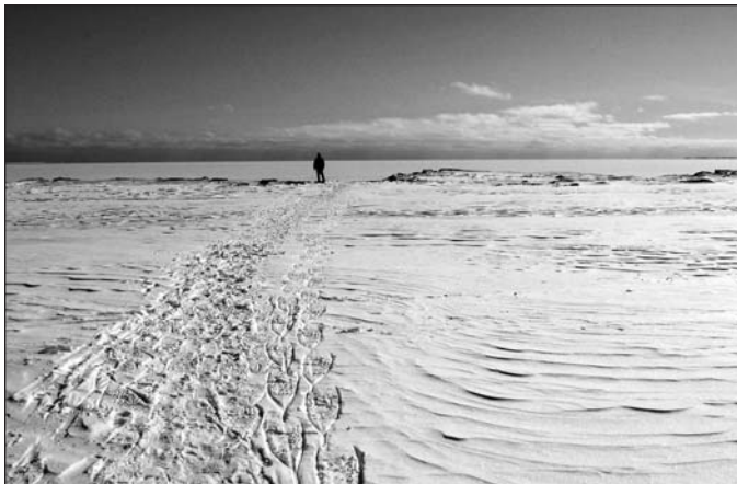
Snowshoe tracks to Baileys Harbor in Door County.